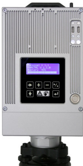
Z+F IMAGER ® , side view

The imaging 3D laser measurement systems are applicable in the fields of digital planning of factories, industrial plants, architecture, protection of historic monuments, landscape and virtual reality. They are based upon the spot Z+F Laser Measurement System LARA.