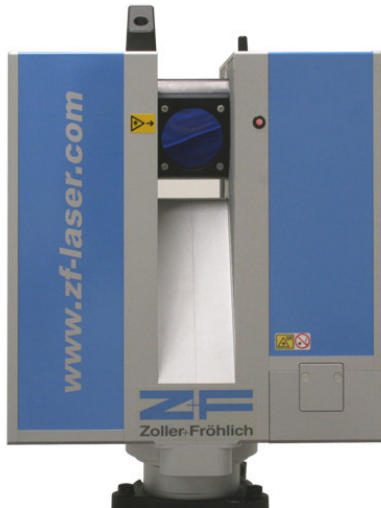
Z+F IMAGER ® , front view