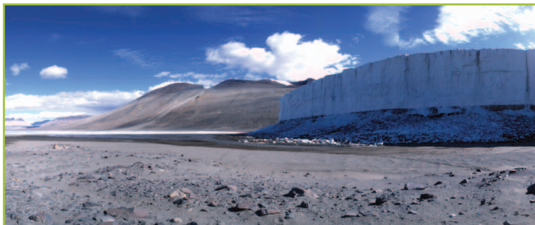
Panoramic digital image of Upper Victoria glacier captured with the I-Site 4400

In 2004 a Mapttek I-Site™ 4400 laser scanner was used to map the position of an Antarctic glacier. The project was investigating the possibility of using terrestrial laser scanners to monitor long-term glacier movement, as part of research conducted by the University of Otago.