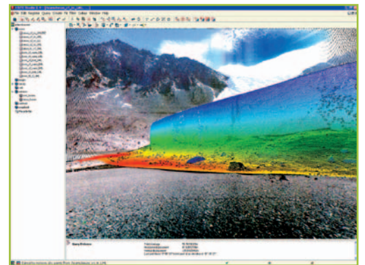
Scan data of Sues glacier

A tense 30 minutes followed while the scanner was set up and orientated, and the scan was carried out with the sound of cracking ice directly above.