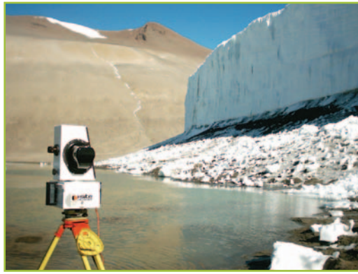
I-Site 4400 set up at base of glacier