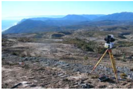
I-Site 4400CR scanner ready for topographic survey in the Stockton open pit