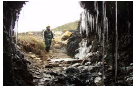
Approaching the portal entrance (above), and typical underground scanning conditions at Stockton (below)

Improved pit design, establishing safe, heavy vehicle access zones, and applying 3D data to machine guidance are expected outcomes.