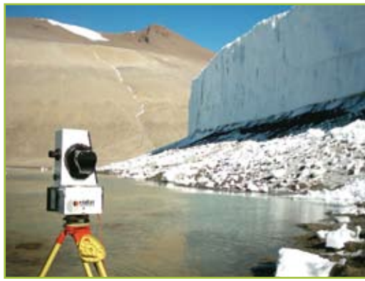
I-Site 4400 set up at base of glacier