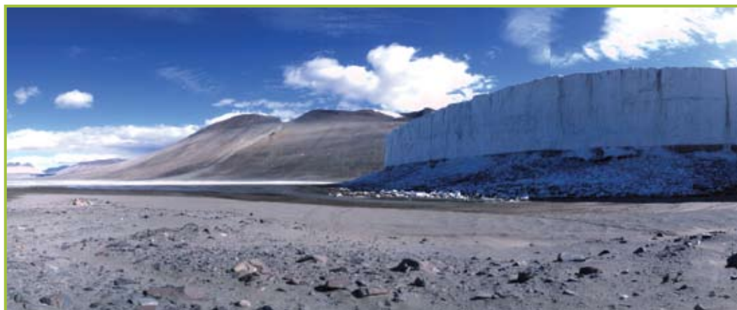
Panoramic digital image of Upper Victoria glacier captured with the I-Site 4400

In 2004 a Mapttek I-Site™ 4400 laser scanner was used to map the position of an Antarctic glacier. The project was investigating the possibility of using terrestrial laser scanners to monitor long-term glacier movement, as part of research conducted by the University of Otago.