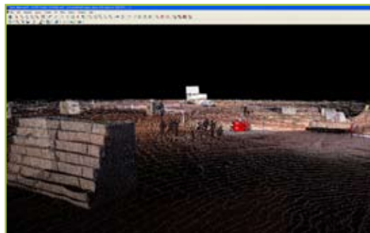
Scan data of the site before the blast in true photographic colour

The accuracy and high volume of data collected with the Maptrek I-Site™ 4400 laser scanner makes it ideal for surveying blast sites. Combined with powerful modelling and scan interrogation capabilities of I-Site Studio, the 4400 scanner provides investigators with abundant data for analysis.