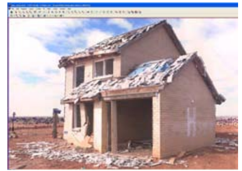
Damage to the house