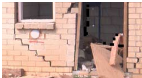
Damage to the house in terms of its overall stability, as well as the destruction of individual materials, can be clearly seen on images acquired and registered automatically to the 3D data by the I-Site 4400

I-Site Studio's powerful modelling capabilities, combined with the scanner's high-resolution imaging allowed for in-depth analysis of the crater and house, so that investigators could better understand the devastating effects of such an event.