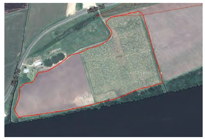
Aerial photograph of trial paddock

Using the I-Site 8810 laser scanning system promises to improve the integrity of the initial surface as well as the accuracy and efficiency of creating it.