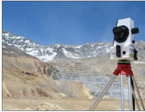
I-Site 4400LR in the open pit at Rio Blanco