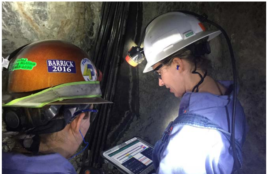
Production geologists using tablet underground