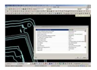
Attach to contours